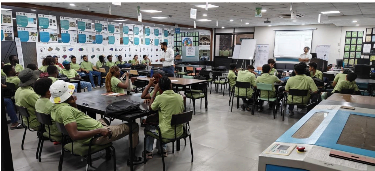
Glimpse of the session on laser cutting and engraving for mechanical students.